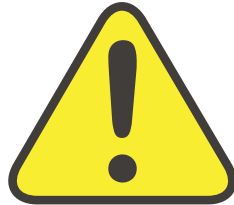
Warning, Danger or Caution Risk of Personal Injury

The symbols below are used throughout this manual to identify important safety information. Heed all warnings and safety information.