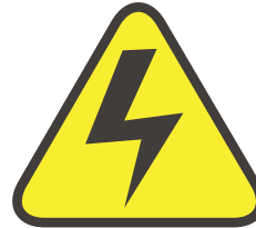
Risk of Electric Shock Risk of severe electric shock