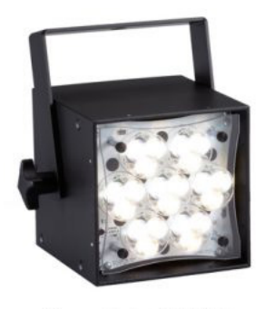
Braq Cube® WNC Designed by The Black Tank

Thank you to 4Wall Entertainment for sharing their story with us and for including our Braq Cube WNC fixtures in their design for this worthwhile event. Visit the Pan-Mass Challenge website to see how you can support their efforts: www.pmc.org