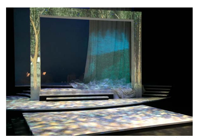
As Caite Hevner's projections added more color & texture, so did Jane's lighting design

I needed to build a complicated light plot to create the journey from monochromatic textured paper sketches, to the color drama at the end of the act. Thankfully, not only did the Guthrie have the Roscolux and GamColor filters I needed, they also had an extensive stock of Rosco & GAM gobos as well! This allowed me to layer different types of colored templates on top of each other to create different effects throughout the show. Working with Caite Hevner's palette, which came from Seurat's actual paintings, allowed us both to create a finely textured world of color and light.