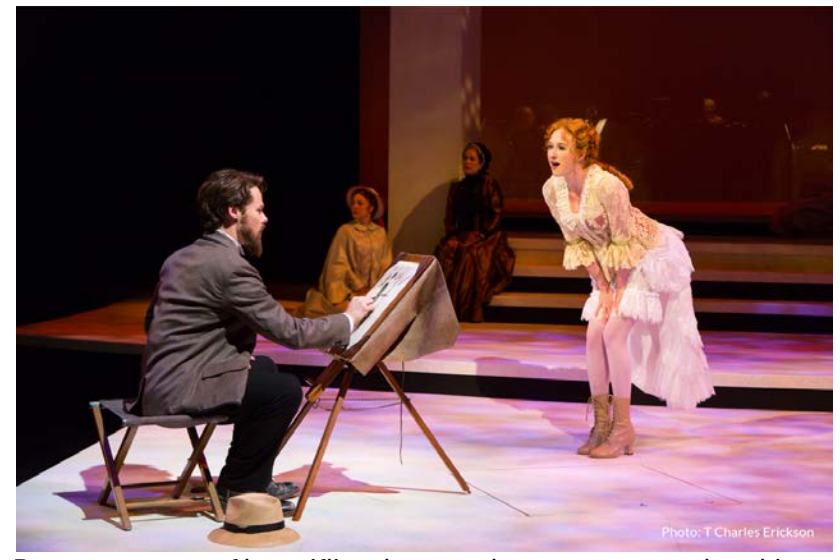
As Dot emerges out of her stifling dress – color emerges onto the white stage

I needed to build a complicated light plot to create the journey from monochromatic textured paper sketches, to the color drama at the end of the act. Thankfully, not only did the Guthrie have the Roscolux and GamColor filters I needed, they also had an extensive stock of Rosco & GAM gobos as well! This allowed me to layer different types of colored templates on top of each other to create different effects throughout the show. Working with Caite Hevner's palette, which came from Seurat's actual paintings, allowed us both to create a finely textured world of color and light.