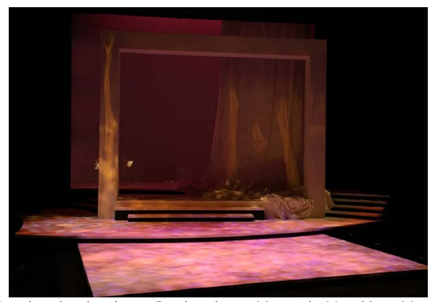
Bumbum bum bumbumbum... Bumbum bum... More red... More blue... More light!

The biggest challenge of moving from this warm no-color towards the richly colored world of Seurat's paintings is that the eye doesn't perceive Seurat's paintings as they perceive gobos. Seurat intended the pointillist dots of color in his paintings to deceive the eye into creating rich vibrant colors, rather than perceiving them as broken up light. In order to accomplish this vibrancy and brightness using theatrical templates, we had to use a variety of tactics, with templates layered on top of each other to create the complexity and depth of color that we see in the painter's work. Working with Caite's greater control of scale in the projections, we were able to achieve a really wide variety of color worlds drawn from Seurat's paintings.