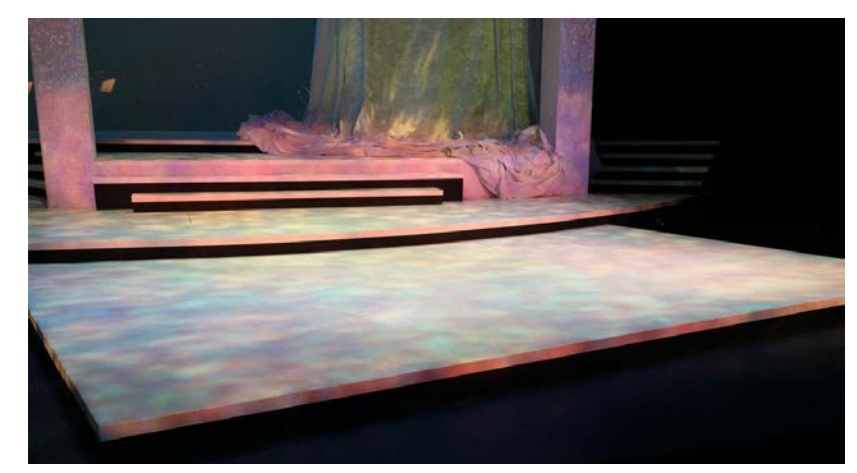
There's no better tool for bringing Impressionism to light on stage than by using Rosco Colorizers

I relied heavily on Rosco's beautiful Stippled Colorizer Effects Glass Gobos to add form, tone, and ultimately order, to the design by adding a soft wash of color. We used three Colorizers – R55008 Stippled Green Yellow, R55006 Stippled Blue Red Lavender and R55005 Stippled Amber Red. Thankfully we had two wonderful followspot operators who were also able to pick faces out of all that color and texture when we needed!