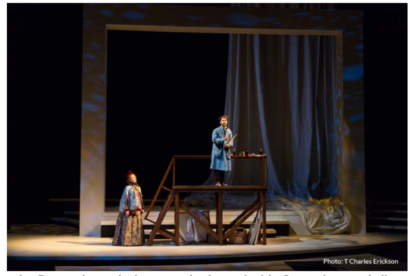
Irregular Dots gobos splash across the frame inside George's warmly lit studio

The biggest challenge of moving from this warm no-color towards the richly colored world of Seurat's paintings is that the eye doesn't perceive Seurat's paintings as they perceive gobos. Seurat intended the pointillist dots of color in his paintings to deceive the eye into creating rich vibrant colors, rather than perceiving them as broken up light. In order to accomplish this vibrancy and brightness using theatrical templates, we had to use a variety of tactics, with templates layered on top of each other to create the complexity and depth of color that we see in the painter's work. Working with Caite's greater control of scale in the projections, we were able to achieve a really wide variety of color worlds drawn from Seurat's paintings.