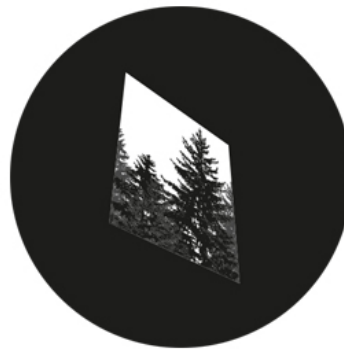
Original gobo image (L) Gobo image with keystone correction (R)