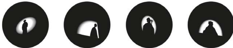
Projected shadow people gobos on the façade of the side building

Visit www.rosco.com to learn more about the Custom Gobo products ACTLD used in this installation and discover how they can enhance your next project.