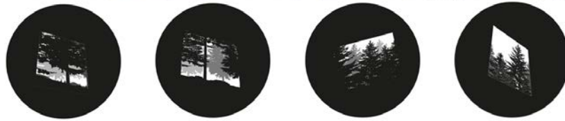
Projected pine tree shadows on the side buildings

Many of the custom gobos needed adjustments to avoid image distortion when projected at an inclined angle onto the ground and buildings. Rosco successfully keystone corrected the original imagery to ensure perfect projection of the gobos.