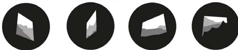
Halftone gobo images project mountain shadows

The spectacle is created using 330 Rosco Black and White Custom Gobos, 15 video projectors, 56 moving heads and 14 washes. The gobos were projected on the side buildings and on the ground to create continuity between the lighting effects.